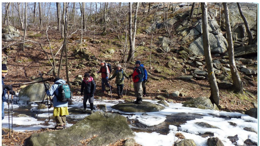
Harriman Park in February. Spring begins March 20!