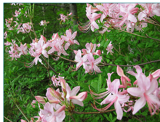
Spring flowers in the Catskills

Now put your map, compass, water, beverages and snacks in your pack. Remember to pack extra clothing that you can layer. It may also be a good idea to include a waterproof jacket, extra socks, and a hat. Spring weather can change as the day progresses. Remember the bug spray, your cell phone and if you like a camera too. A hiker's delight is truly waiting for anyone who will come outdoors and hike this spring. Enjoy your day on the trail!