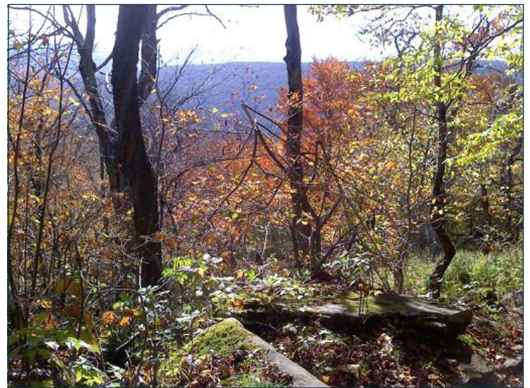
Balsam Lake Mountain - Catskills. Hike on Oct.7th led by Deanna Felicetta with Lark in the Woods. See schedule for details.